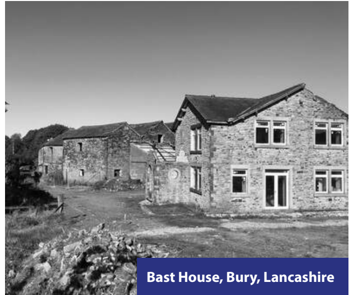
Bast House, Bury, Lancashire