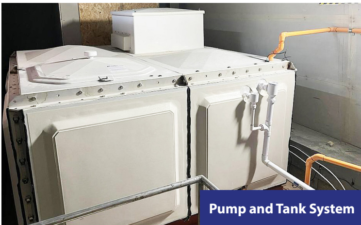
Pump and Tank System

Our engineers are industry qualified professionals who take great pride in the quality of their work.