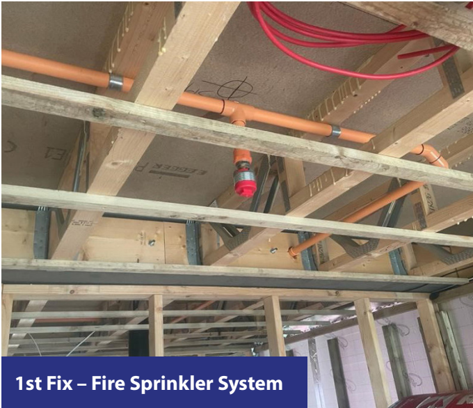
1st Fix – Fire Sprinkler System