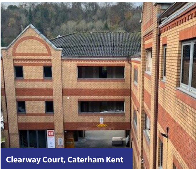
Clearway Court, Caterham Kent